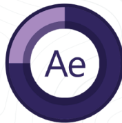
After Effects (Advanced)